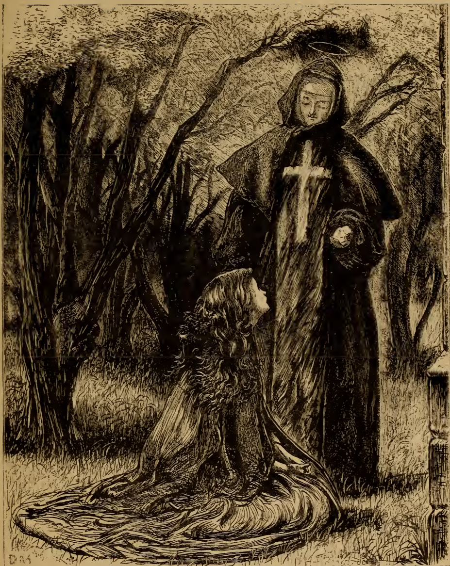
A LEGEND OF PROVENCE.